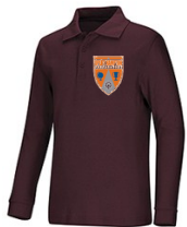
Item No. AG58352

Kick Pleat Skirt: $15.50 Scooter: $15.50 (Youth & Youth Plus) $21.00 (Juniors) Black Tie / Cross Tie: $5.00