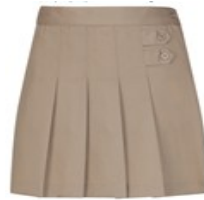
Item No. AG55122A