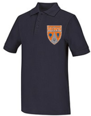
Item No. AG58322