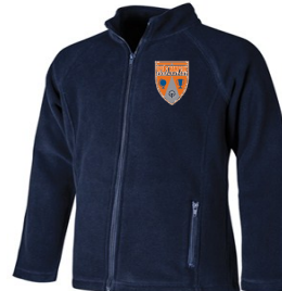
Item No. AG59202

Cardigan: $26.00 Fleece Jacket: $26.00 Available Colors: Navy