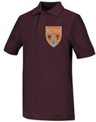
Item No. AG58322