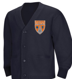
Item No. AG56432

Please add $1 for each size larger than XL