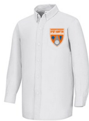
Item No. AG57652