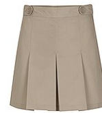
Item No. AG55863