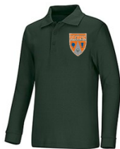
Item No. AG57654