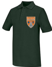
Item No. AG58322