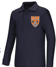
Item No. AG58352